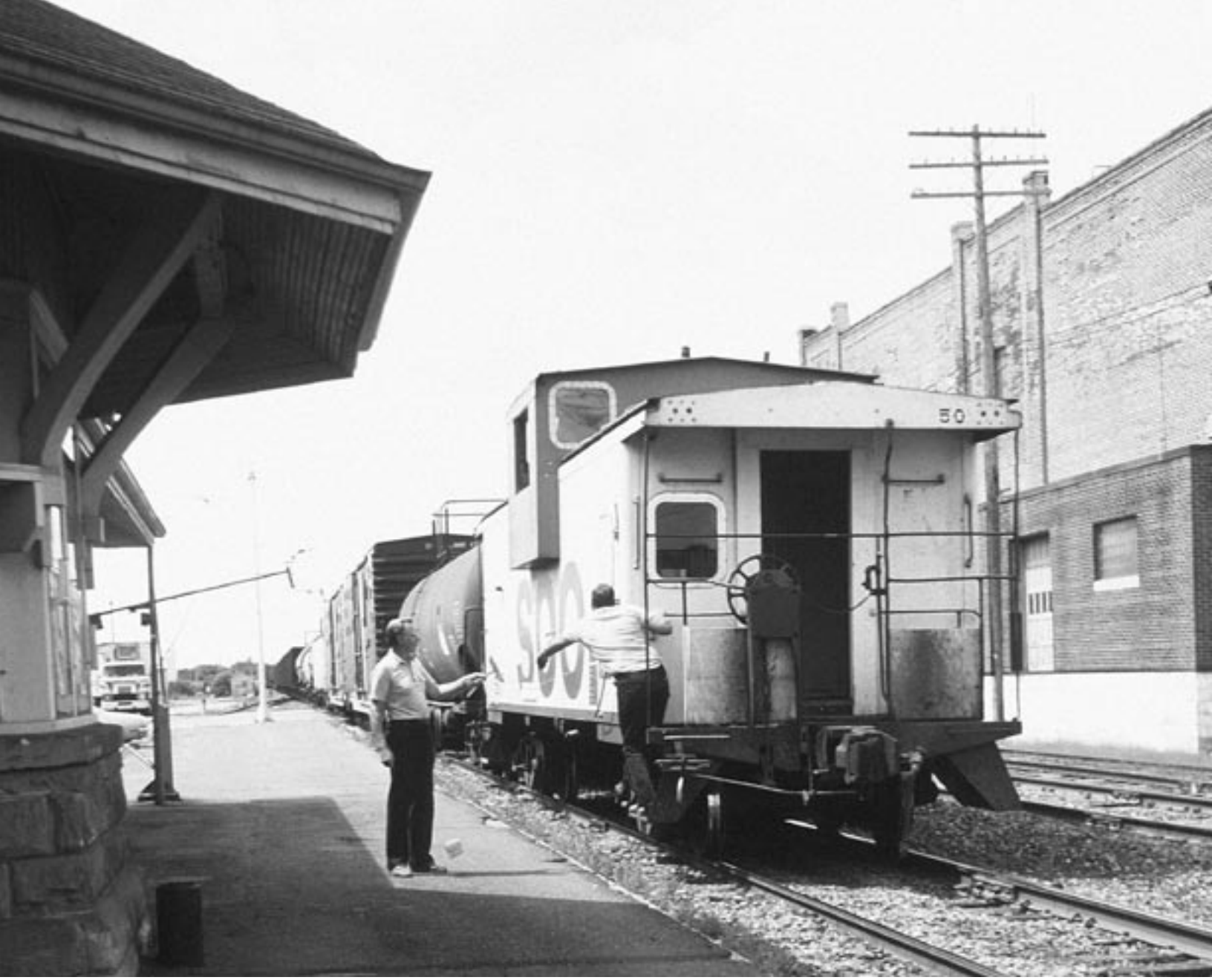
Picking up orders at Marshfield, WI—Larry Miskkar

Please detach this pledge card, fill it out and mail it in a business-size envelope to: